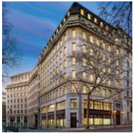
ALDWYCH HOUSE, LONDON, UK