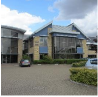
334 & 335 CAMBRIDGE SCIENCE PARK, CAMBRIDGE, UK