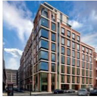
5 HOWICK PLACE, LONDON, UK