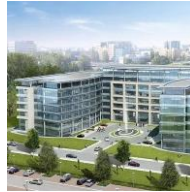
TRINITY PARK 3, WARSAW, POLAND