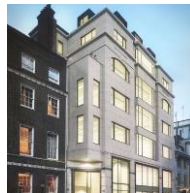
12 GOLDEN SQUARE, LONDON, UK