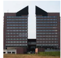
QUINTIQ, HERTOGENBOSCH, NETHERLANDS